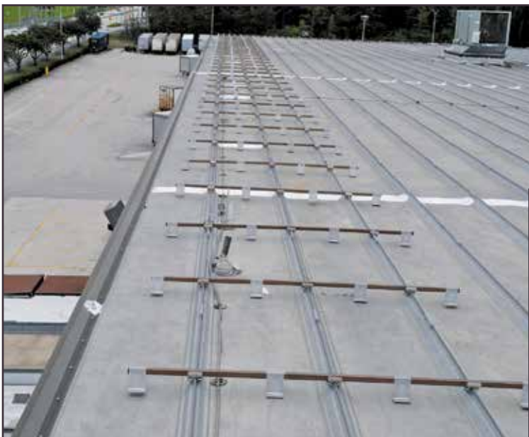
External purlins prevent panel uplift.

snap-together roof panel using the ASTM E1592 guidelines with its system and observed considerable improvements in performance with minimal seam deformation. For example, when roof clips were placed at 4 ft. on center with the external purlin system at 4 ft. spaced between the clips, the panel performance was doubled. Without the system, the panel failed (due to seam disengagement) at 41.6 psf. With the system, the panel failed (due to clip deformation) at 78 psf. Even more impressive, when the same roof panel system was tested at 1 ft., 6 in. on center, the limits of the testing chamber were reached before panel failure occurred. Without the external purlin system, the panels failed at 80.6 psf. With it attached, 250 psf—the maximum capacity of the test chamber—was reached. Thomas M. Shingler, PE, registered structural engineer and president of Design Dynamics, Inc. of Dallas, TX, observed the