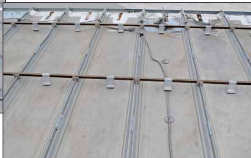
External purlin system on a standing-seam building in South Florida.